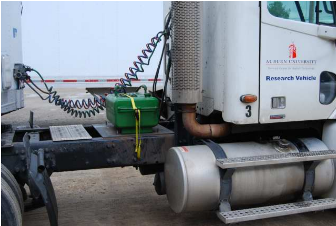
Figure 3 –Portable Weigh Tank

within the prescribed 2 percent filtering band were used to compute an average value representing each segment of testing.