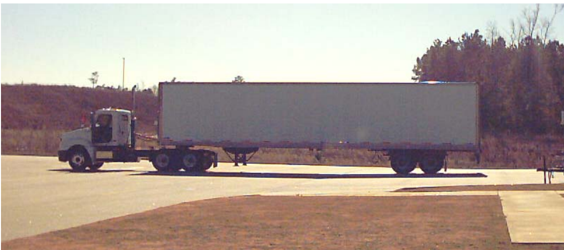
Figure 1 – Truck Configuration Used During the Testing Process

All fuel used was ultra low sulfur #2 diesel, verified by specific gravity at the time of testing. Any accessories that would have pulled auxiliary power were used in an identical manner in both tractors during all stages of Type II testing. Mirrors and windows were maintained in the same position for all stages of operation. Tire pressures were adjusted as necessary prior to the first test run on each day to ensure that all tires were within 5 psi of the manufacturers’ recommended cold inflation temperatures. Each tractor pulled standard cargo van trailers that were loaded to a GVW of 76,500 Lbs.