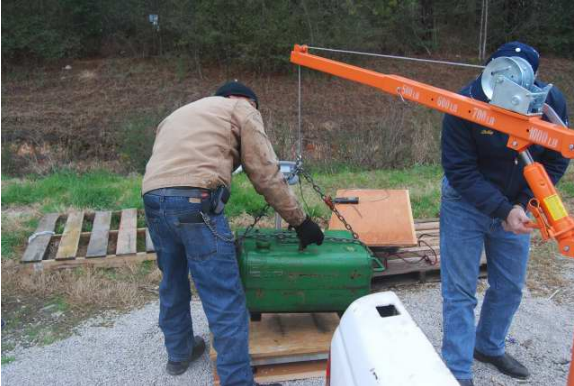
Figure 4 – Weighing Portable Tank to Within a Tenth of a Pound

During testing, fuel consumption was measured in 17-gallon portable weigh tanks that accommodated 1 test run on a single fill. The weight of fuel consumed after each 41.6-mile run was measured on an Ohaus Champ II Model CH300R digital scale with a 650 pound capacity. Scale calibration was checked before and after each stage of testing. The same drivers remained with both the control vehicle and the treatment vehicle for the duration of testing.