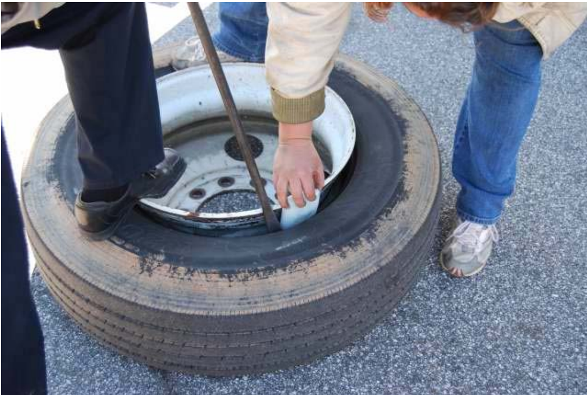
Figure 5 – Installation of Counteract Balancing Beads